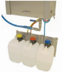
SAFETY CAN SYSTEM