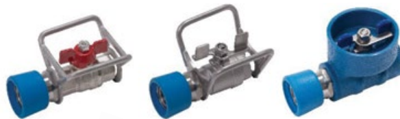
LOW PRESSURE VALVE