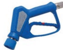
LOW PRESSURE GUN