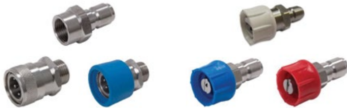
QUICK CONNECT COUPLINGS